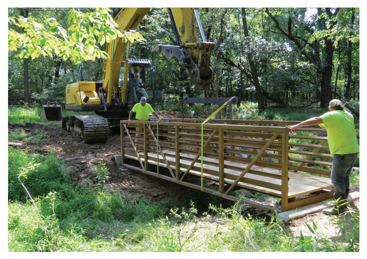
Footbridge is placed on concrete footers.

of planning, vendor evaluation, and fundraising/grant-writing spearheaded by Langhorne Open Space, the implementation phase of the project began two years ago. The massive project involved restoring and fortifying a severely eroded streambank, beautification of the Maple Avenue entrance, signage installation, trail improvements (including handicap accessibility to the main segment), and extensive plantings to re-establish wooded areas disturbed by the construction. Overseen jointly by Langhorne Borough and LOSI, the project is now nearing completion.