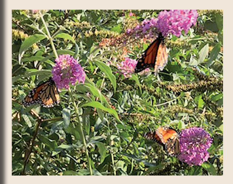
Monarchs visit Heritage Farm's Butterfly Garden.

It is not just the scientific foundations that are tracking and tagging Monarchs. Deb Tyl reported that nearby Churchville Nature Center recently released tagged butterflies in an effort to track their progress. (Tags are very small – no bigger than a hole punch.) "We've seen a tagged Monarch in our Butterfly Garden in early October which may have been from the Churchville release," said Debbie. So, be on the lookout in your garden and visit the Butterfly Garden at the Farm to see Debbie's good work and some beautiful 'monarchs' in all their splendor!