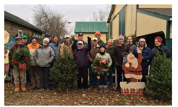
Last year's tree-unloading volunteers.

We provide hot beverages and a hearty lunch for our volunteer sales people!