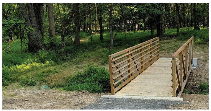
East now meets West at Catawissa Nature Preserve.