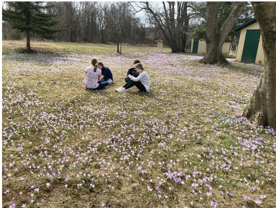
Crocuses at the Farm