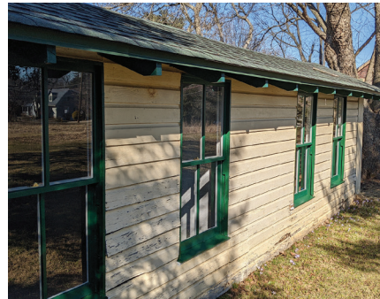
The newly restored windows on the chicken coop building which now hosts two artist studios.

Keeping up and beautifying buildings, some of which are well over 100 years old, is a mission. The support of our loyal and generous members allow us to continue this important mission.