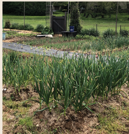
Garlic (foreground) is already thriving!

Our gardeners help each other throughout the season by sharing seedlings, erecting fencing, and picking up debris. Best of luck to all of them this growing season!