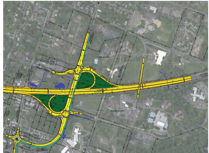
Proposed Cloverleaf interchange at Rte 1 and Pine Street.

The LOSI Board of Directors met to discuss what action,