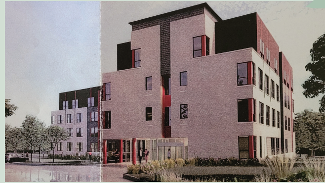
Proposed high-rise apartment building.

Due to the length of time needed to hear further arguments and the comments of the large number of people attending (almost all opposing the project), the meeting was adjourned at 10PM to be continued on Wednesday, June 8.